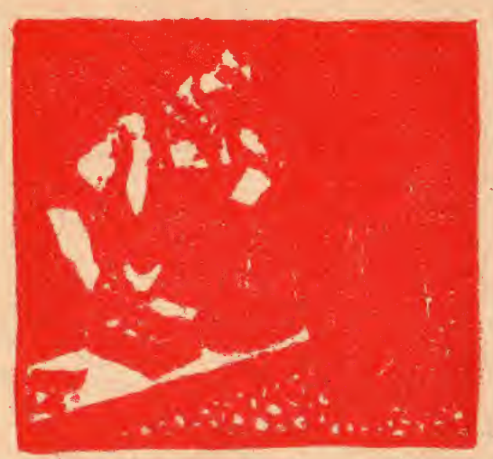
PRICE 10 CENTS

PUBLISHED FOR THE WORKERS PARTY OF AMERICA